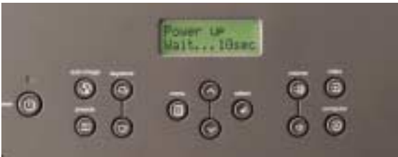
View the status of your projector via the LCD window on top of the unit.